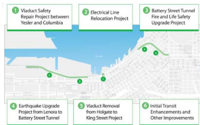
Figure 2: Moving Forward Projects

Early examination assumed the solution to the central waterfront had to replace existing vehicular capacity along the Aurora corridor. The new objectives of the plan include expanding the study area to look at the larger corridor and beyond the movement of vehicles to also include people and goods. The entire transit system will be looked at including surface streets, I-5, and other routes.